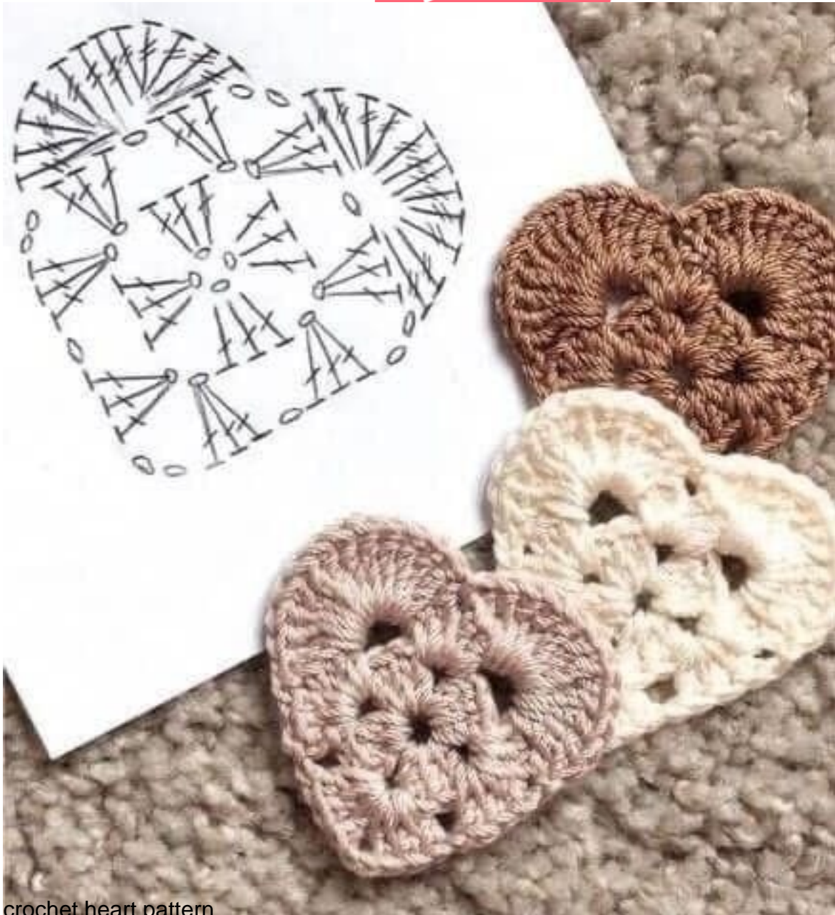
crochet heart pattern